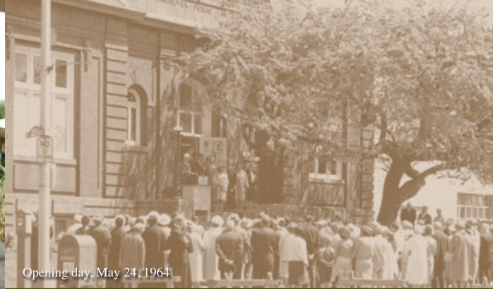
Opening day, May 24, 1964