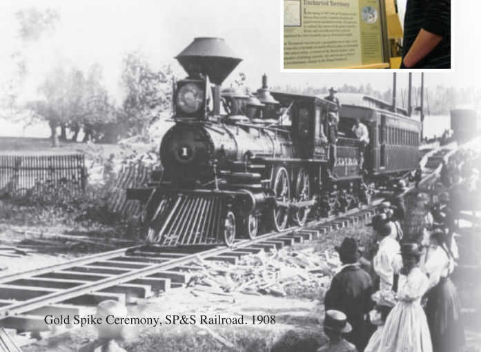
Gold Spike Ceremony, SP&S Railroad. 1908